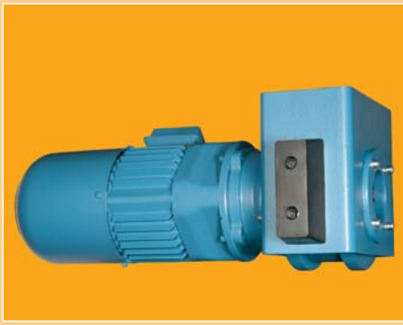
KS 20 with FP