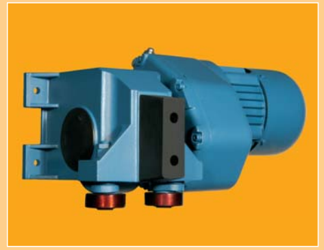
K 20 with FG 053

For hoist trolleys and standard cranes. Shaft mounted soft start drives directly coupled to double flange wheels. Gearbox maintenance-free.