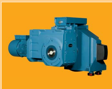
K 50 with WG 3.53

Ideal for hoist trolleys and cranes with larger capacities. FEM classification 3 m. Drives either frequency controlled or pole-changing with soft start flywheel. Shaft-hub-connection by toothed shaft with involute flanks. The wheel bogies Type K have flangeless running wheels made from spheroidal cast iron, are prepared for bolting to mounting plate. Lateral guide rollers adjustable via eccentric bushings. Enhanced travel performance and low value side forces.